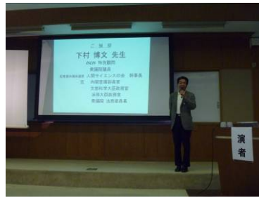
Hakubun SHIMOMURA, House of Representatives, Special Advisor of ISLIS